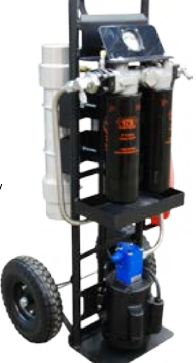
Portable Membrane Dehydration System