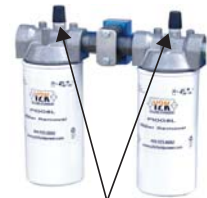
All Y2K Filter carts come standard with Visual Delta P Indicators. When the color changes, please change the element.